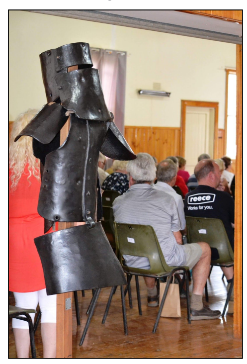
Replica of Ned's Armour

We would love more local human interest stories. Please forward them, with the permission of the subject, to <a href="mailto:gretabunyip@gmail.com">gretabunyip@gmail.com</a>